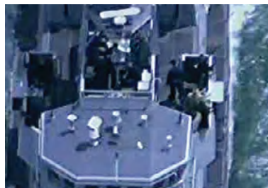
Downlink imagery from EO camera