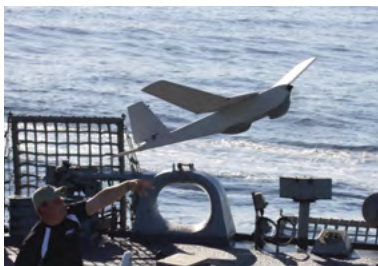
Puma is launched from a ship

Puma AE (All Environment) is a fully waterproof, small, unmanned aircraft system (UAS) designed for land and maritime operations. Capable of landing in water or on land, the Puma AE empowers the operator with an operational flexibility never before available in the small UAS class. The enhanced precision navigation system with secondary GPS provides greater positional accuracy and reliability of the Puma AE. AeroVironment's common ground control system allows the operator to control the aircraft manually or program it for GPS-based autonomous navigation.